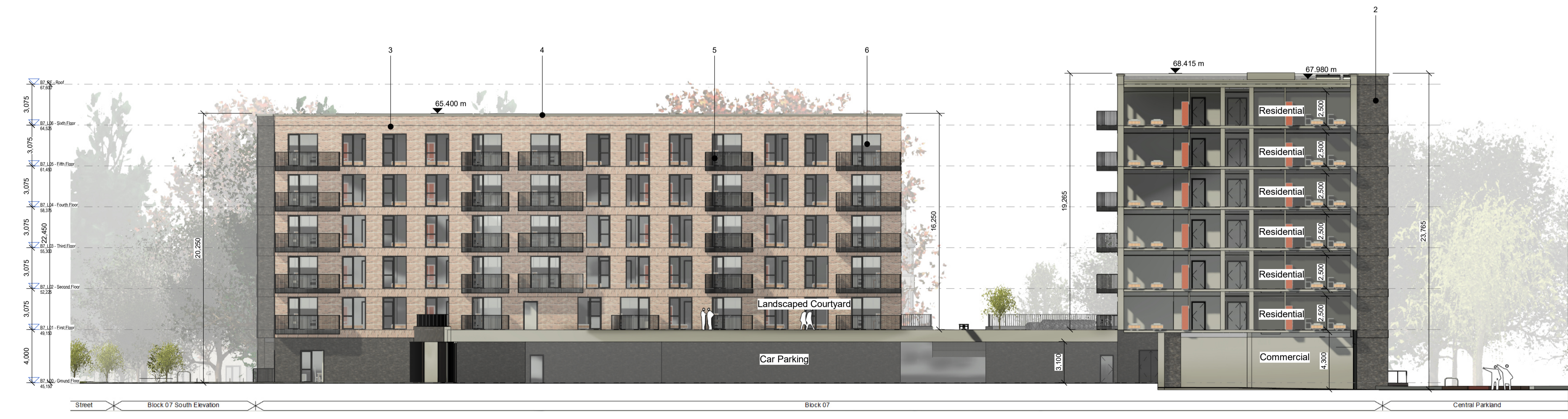
Section B-B 1 : 200