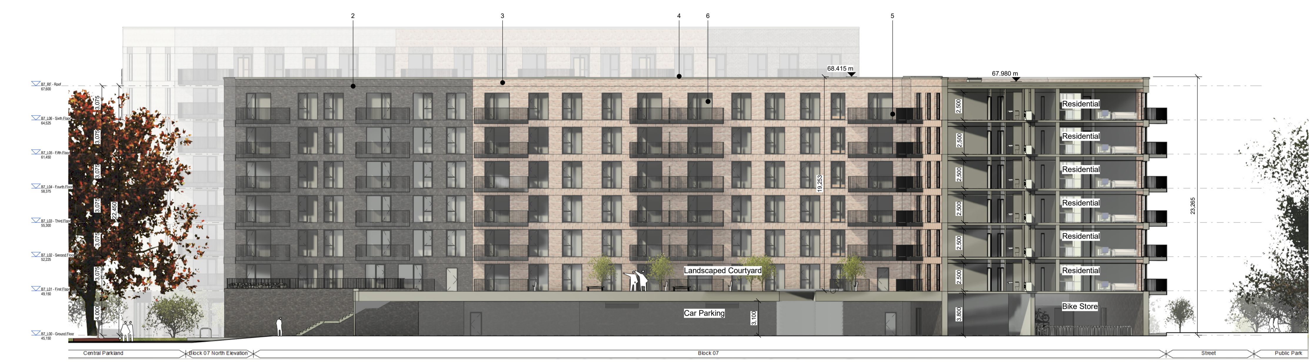
Section A-A 1 : 200